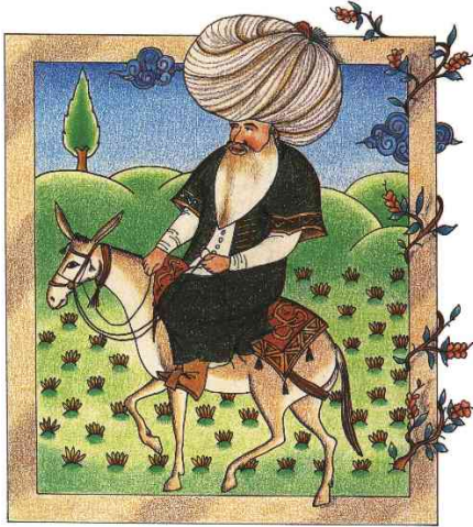
17th century miniature from Turkey

Claims about his origin are made by many ethnic groups. Many sources give the birthplace of Nasreddin as Hortu Village in Sivrihisar, Eskişehir Province, present-day Turkey, in the 13th century, after which he settled in Akşehir, and later in Konya under the Seljuq rule, where he died in 1275/6 or 1285/6 CE. The alleged tomb of Nasreddin is in Akşehir and the " International Nasreddin Hodja Festival " is held annually in Akşehir between 5–10 July.