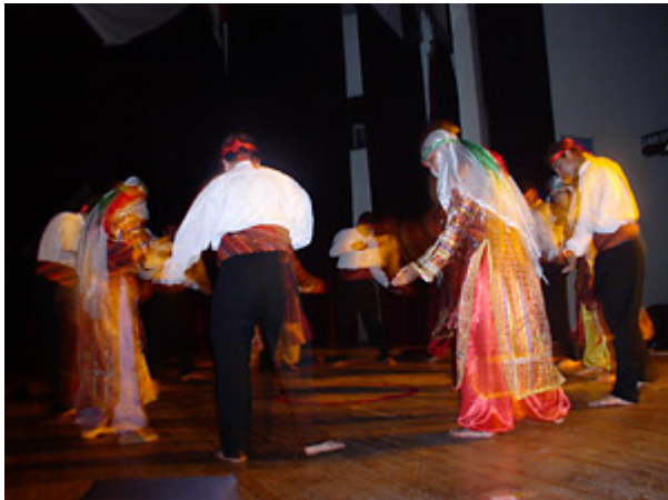
Alevi-Bektashi Ceremony today