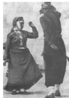
Alevi dancing from southern Anatolia 1976