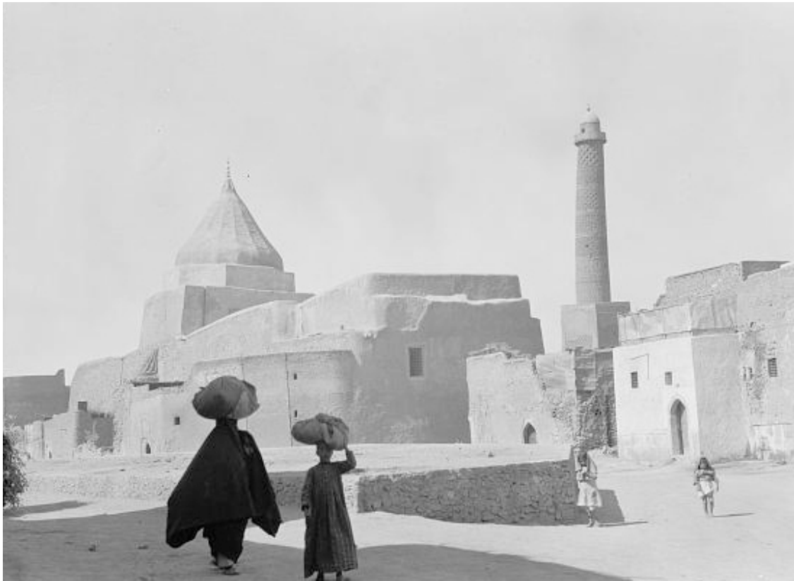
Mosul in 19th century showing Yezidi shrine on the left.