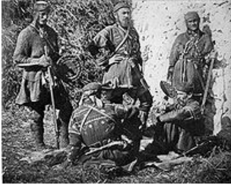
Mutso, Kkhevsureti, Georgia

Khevsureti/Khevsuria (Georgian: ხევსურეთი, a land of valleys ) is a historical-ethnographic region in eastern Georgia. They are the branch of Kartvelian (Georgian) people located along both the northern (Pirikita khevsureti, Georgian: პირიქითა ხევსურეთი) and southern (Piraketa khevsureti, Georgian: პირაქეთა ხევსურეთი) slopes of the Great Caucasus Mountains.