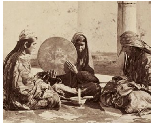
Tajik women conducting divination mid 19th century