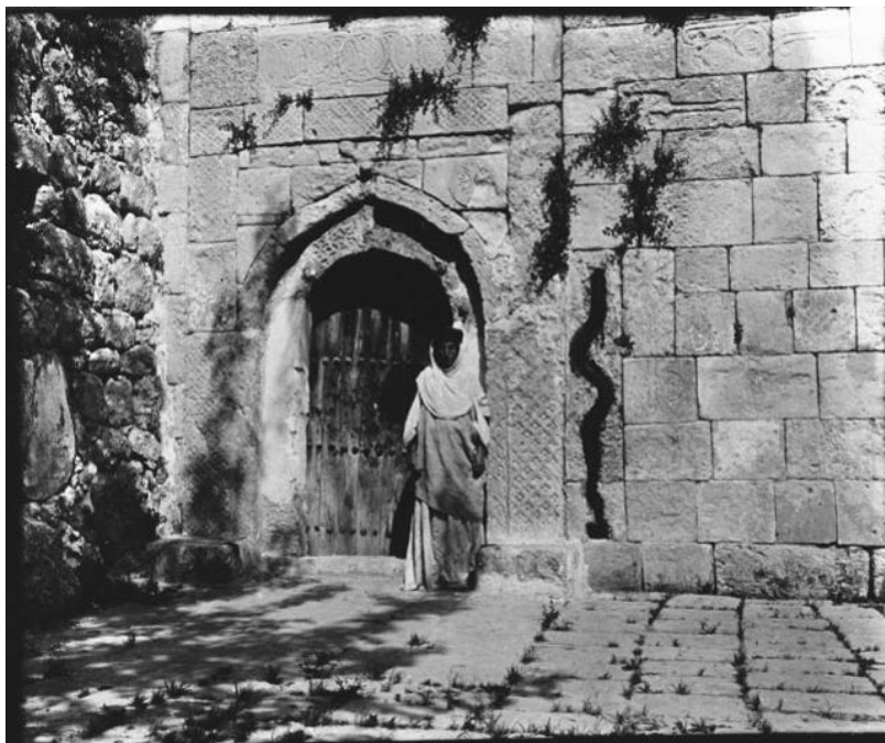
Shrine of Sheikh 'Adi - founder of the Yezidi faith - inner court, 1909