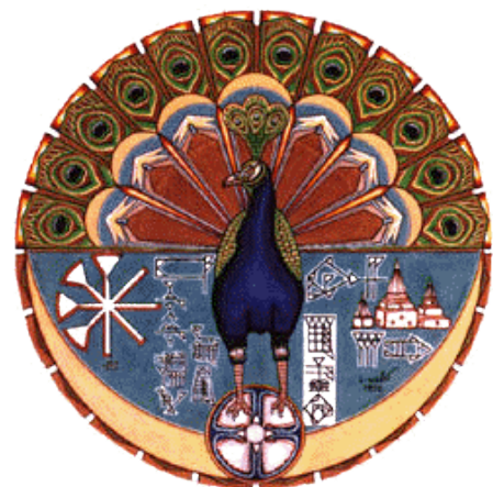
Peacock Symbol of Yezidis